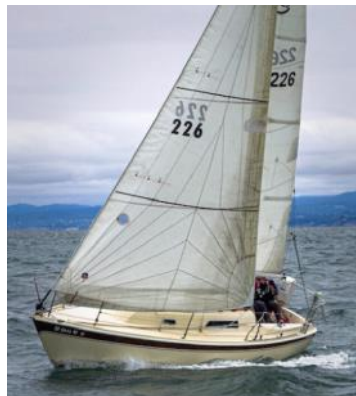
Un Bel Di under a full press of sail.