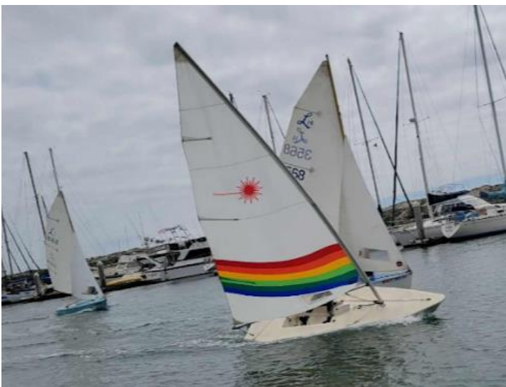
Lasers and Lidos, oh my!!