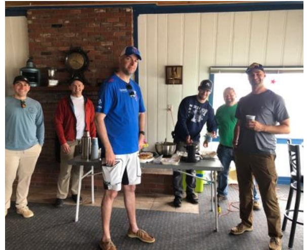
Fresh cooked waffles at the skippers meeting.