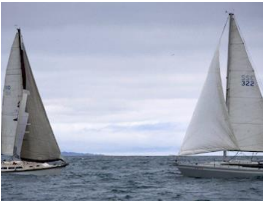
"STARBOARD!!!" Cutlass (left) and Aquanaut maneuver for position pre-start.