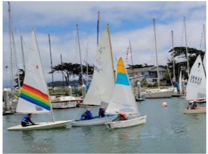
Racers jockey for position at the starting line.