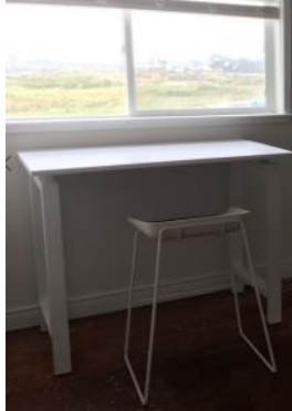
42 " high 23.4 " deep Top size 48" by 30" Table by UPLIFT Desk $299

FOR RENT-UNIT B - $180 100sq. ft. UNIT X - $797/month. 444sq. ft. Contact Melissa at (831) 724-3975 or at eyc@elkhornyachtclub.org