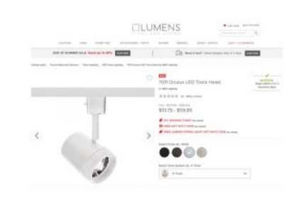
$350 was Kim's cost