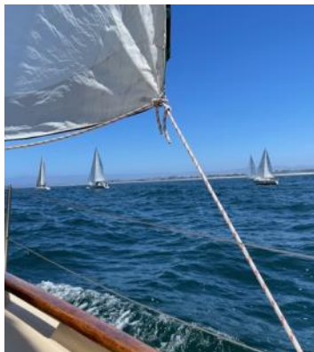
View of the fleet from Solace's starboard bow