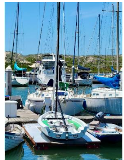
The Quest on her new dock home.