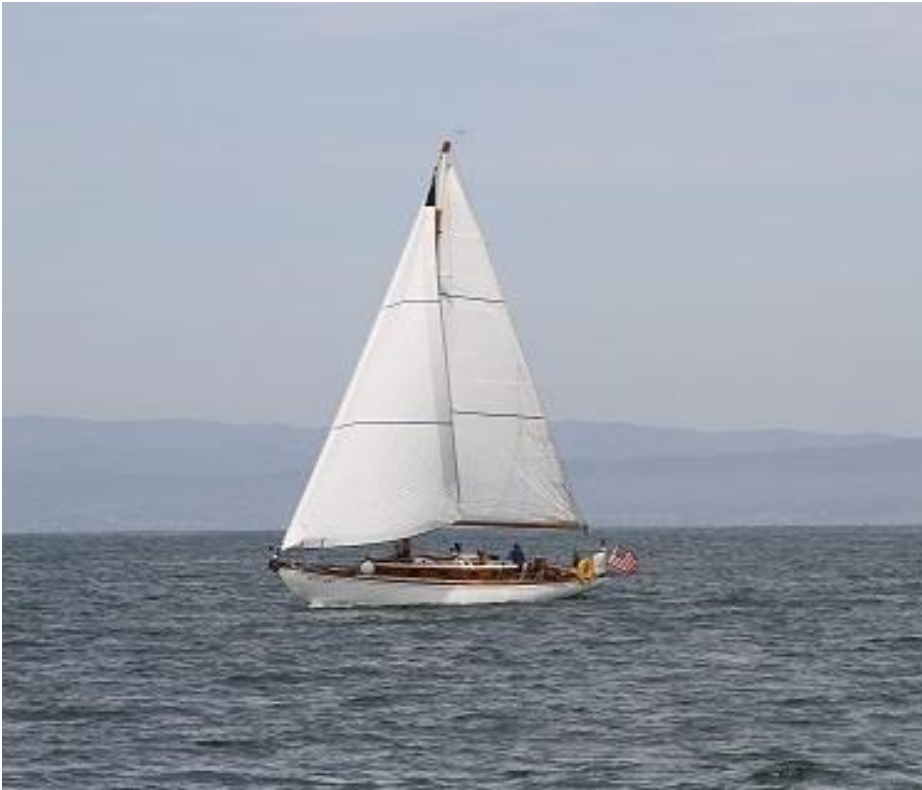
Sea Dreamer out for a sail